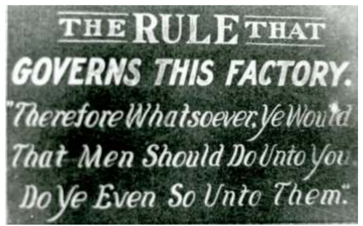
Sign hung above Toledo, Ohio factory entrance in 1913

This teaching by Jesus does not allow us to treat others any way we choose as long as we would not mind being treated the same way. The world at the time of Noah was destroyed by the flood because people continually treated others sinfully and expected the same behavior toward themselves (Genesis 6:5).