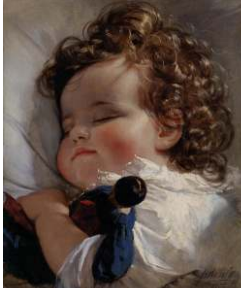
Princess Marie Franziska von Liechtenstein at age two Friedrich von Amerling, 1836

The above example reveals that a six-month old fetus not only can detect a person who had been conceived just weeks earlier but also can recognize their mother's voice and respond to it! It would be ridiculous to think that Elizabeth's child was responding to an abortable "mass of tissue" inside Mary!