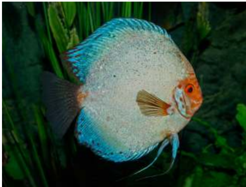
Figure 5. A typical 'rayed' fin by comparison, on the side of a Symphysodon aequifasciatus at Germany's Karlsruhe Zoo.

It is clearly well-designed as a deep-water fish. In fact, coelacanths cannot survive long outside this very specific niche. Comoran fishermen caught 150 between 1952 and 1987. They attempted to save them, even placing them in aquarium tanks, but all died within a few hours.