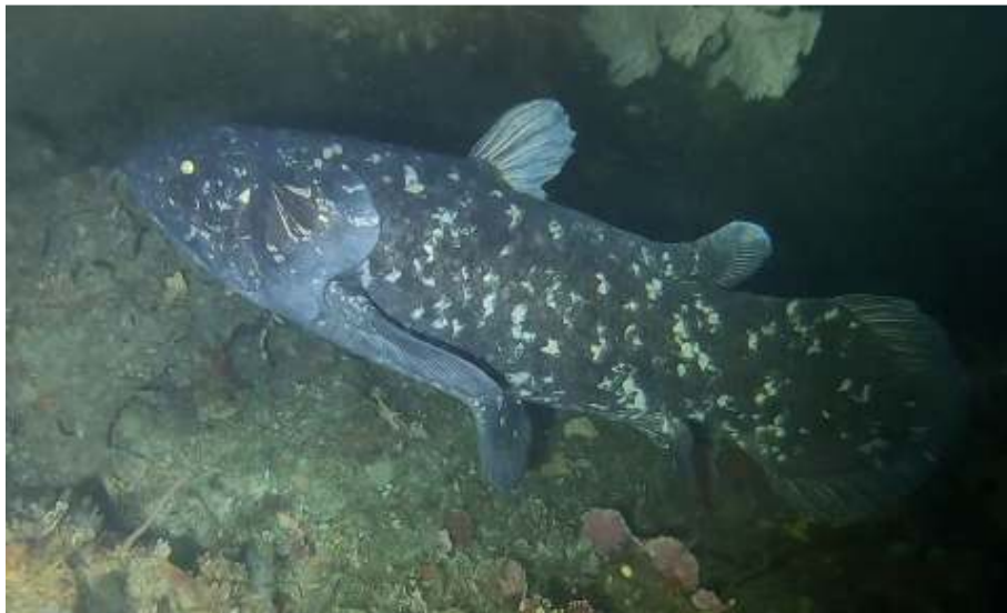
Figure 2. Live coelacanth off the South African coast in 2019.

In 1938, the discovery of a live coelacanth near Madagascar astounded evolutionists. It was like finding a live dinosaur! Once the discovery was confirmed, newspaper headlines all over the world proclaimed the amazing news.