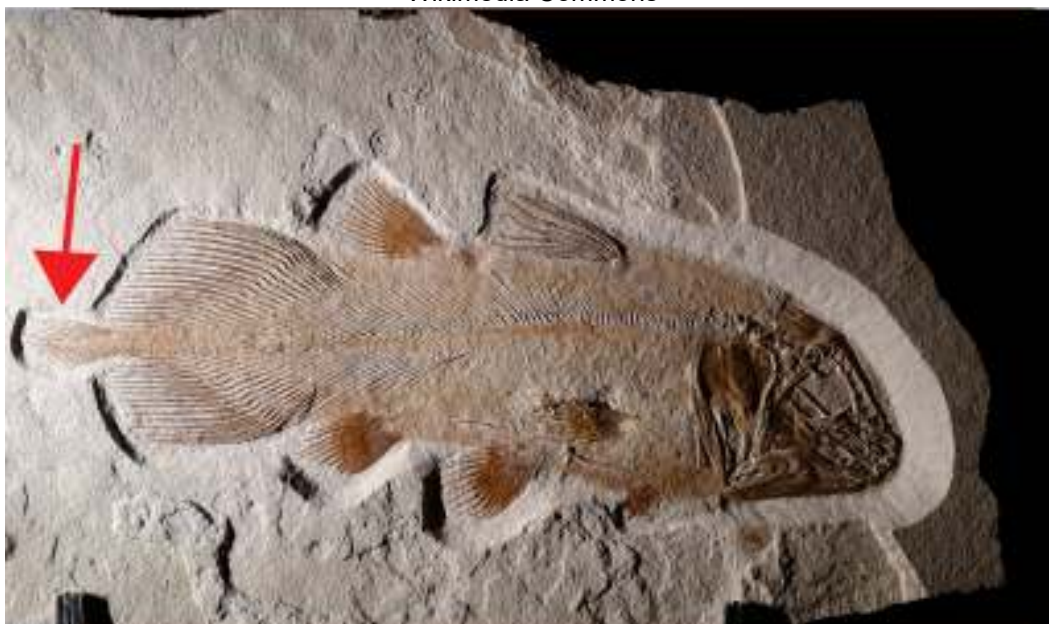
Figure 3. Coelacanth fossil from Jurassic limestone, c. 150m years ‘old’. Arrow shows epicaudal fin.