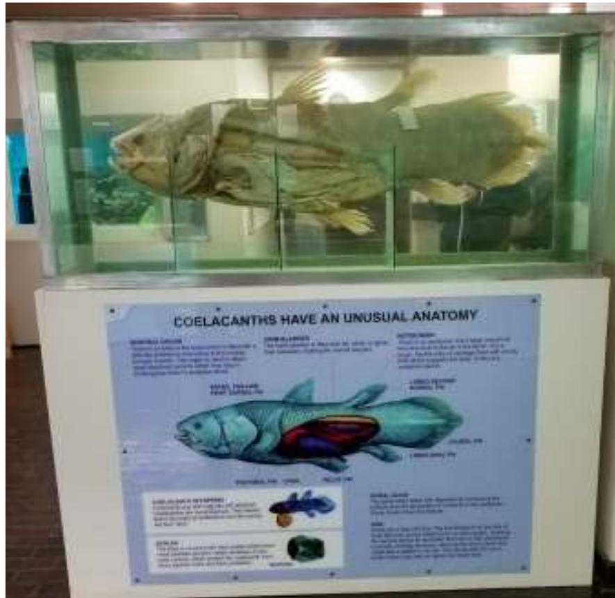
Figure 1. Preserved modern coelacanth with some of its anatomy on display in Makhanda, South Africa.