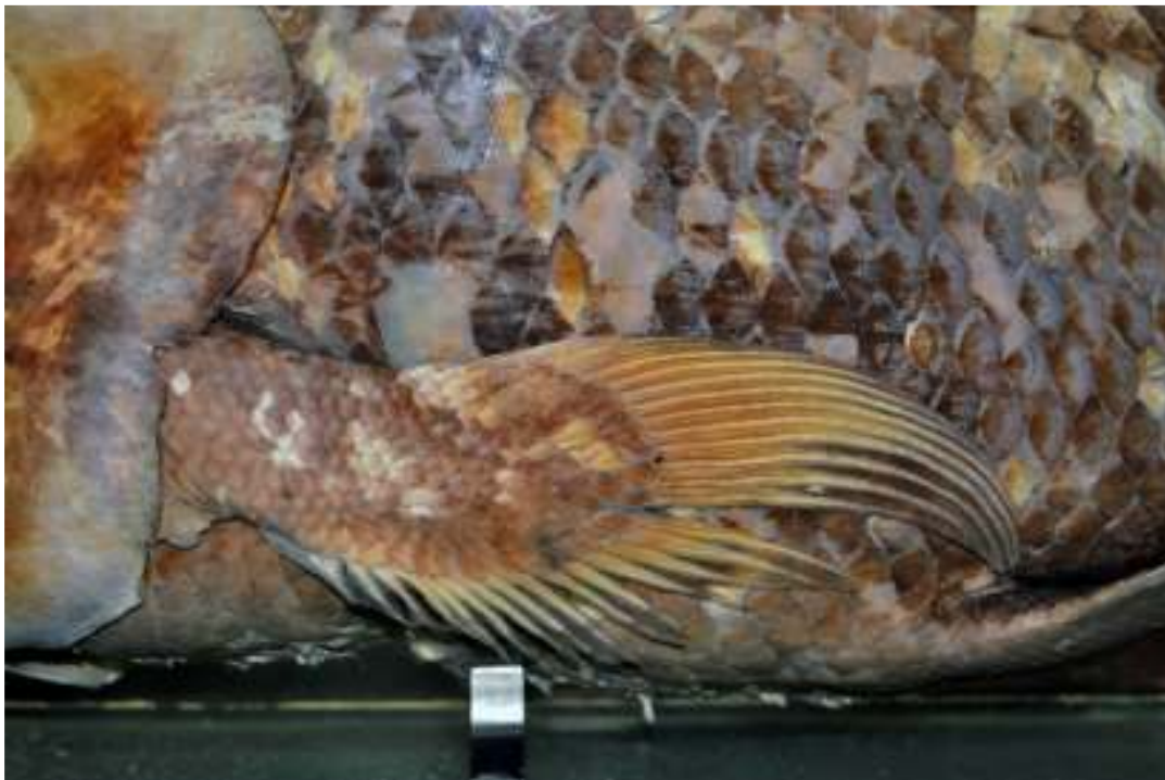
Figure 4. The pectoral 'lobed' fin of a Coelacanth ( Latimeria chalumnae ) from the Muséum national d'histoire naturelle (Paris, France). The lobe contains muscle and bone.

Coelacanths have unique traits that make it difficult for evolutionists to claim what creature they evolved from, and what creature they might have evolved into. For example, most fish have smooth scales; however, coelacanth scales are smooth on the lower half of their bodies, and rough on the upper half. The steel-blue colour of their scales is also unique.