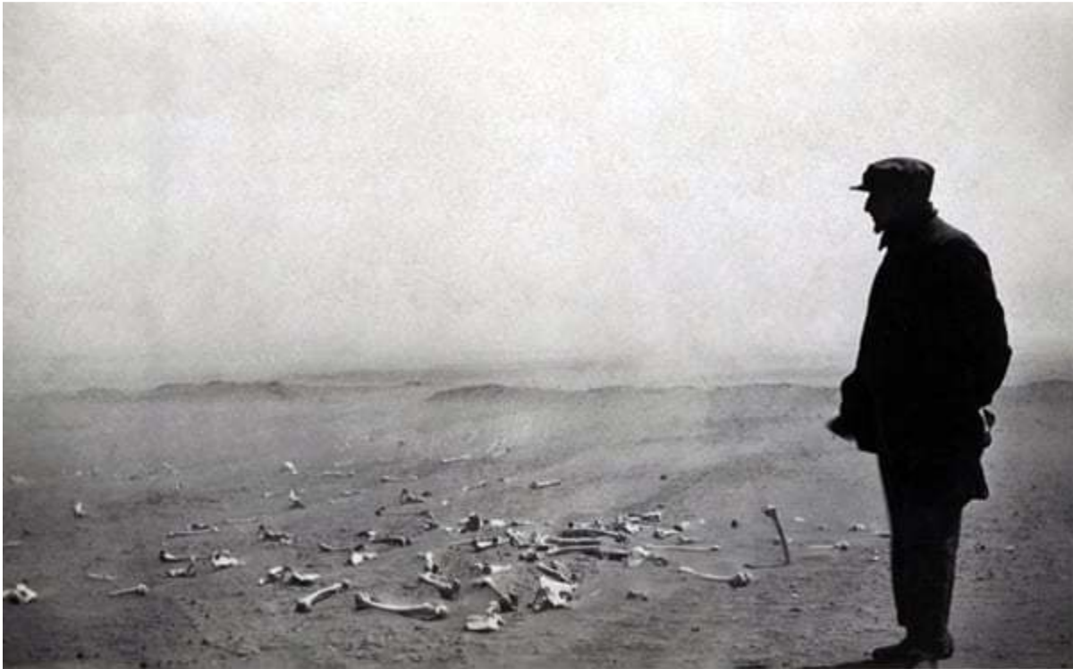
Armenian looking at the human remains at Der el-Zor, 1916.

And just to bring things full circle, consider the primary role model for caliphate-wannabes like ISIS. No, it's not Hitler, even though ISIS and Hitler share an infinite hatred for Jews. Rather, it's the world's previous Sunni Islamic caliphate – namely, the Turkish Ottoman Empire, whose martyrdom of 1.5 million Armenian Christians is being remembered today.