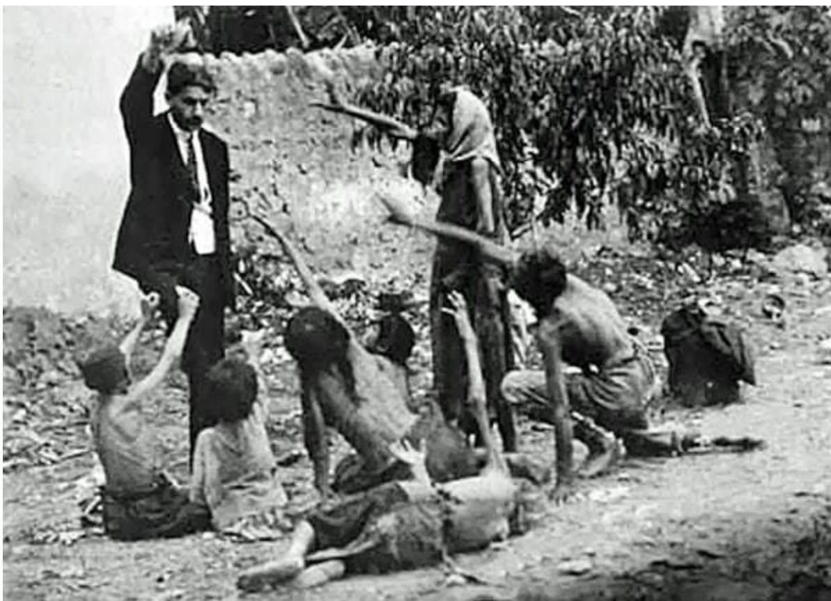
A Turkish official torments starving Armenian children by showing them a piece of bread during the Armenian Genocide

Really? Living and sharing with your neighbors for years, borrowing hummus and olive oil when you ran short – and then suddenly turning on them in a frenzy of "indiscriminate slaughter"? Doesn't sound exactly normal to me.