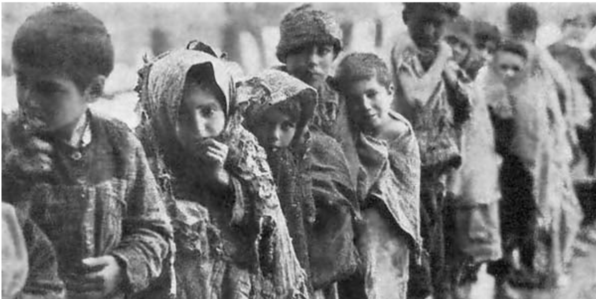
Children victims of the Armenian Genocide

'A distant signal was given – it sounded something like a trumpet...'