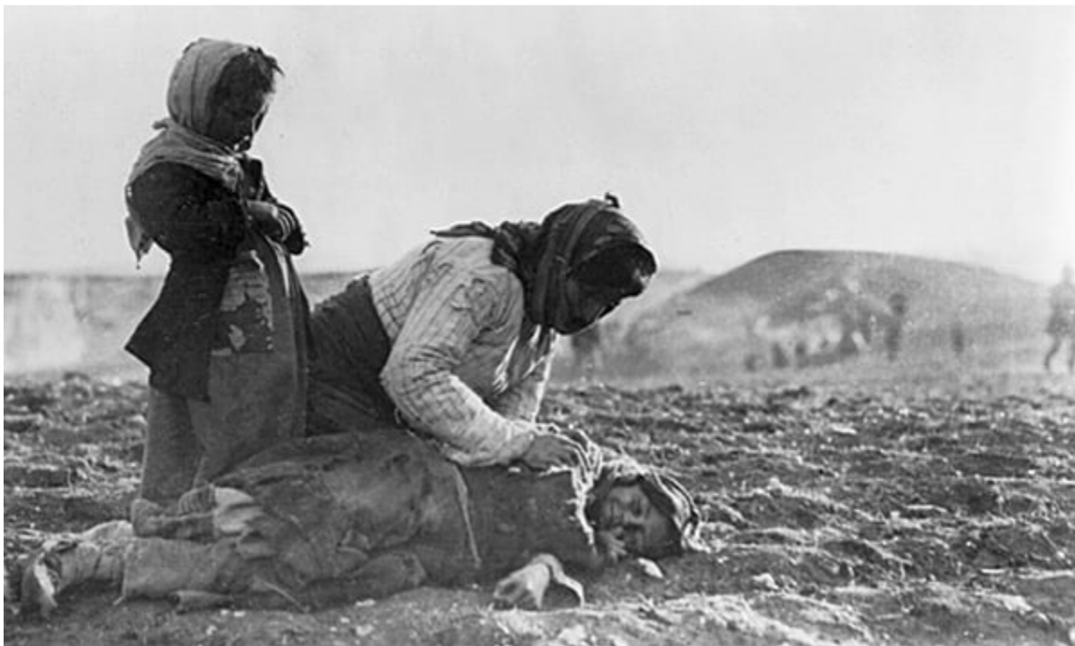
An Armenian woman kneels beside a dead child in a field outside Aleppo

You see, whether it's ISIS, al-Qaida, Boko Haram, the Al Nusra Front or other modern-day jihadists, or their Turkish predecessors in the Ottoman Caliphate a century ago; whether, for that matter, it's the Christian-hating automatons of North Korea or in other communist nations throughout the world – when it comes to those who persecute Christians, we are looking at people firmly in the grip of exceedingly dark forces. And since darkness cannot stand the light – it burns – they feel compelled to attempt to put it out. Yet they cannot. For although the persecutors enslave, they are the true slaves; though they imprison, they are the real prisoners; though they kill, they are the ones spiritually dying.