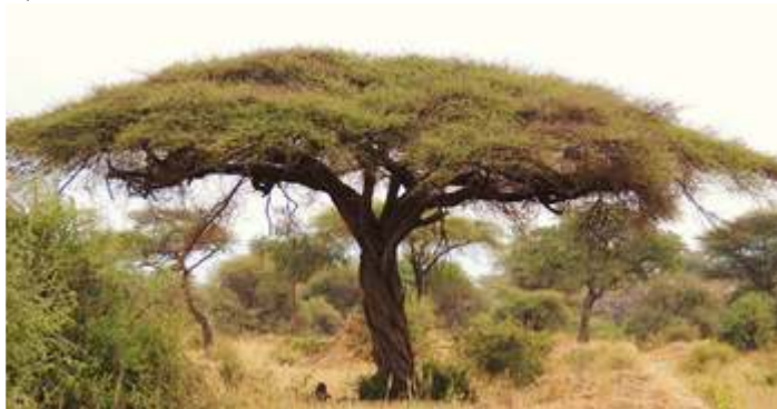
Vachellia (or Acacia) tree used to create Israel's wilderness tabernacle.

"A hard and durable but light wood; at first yellowish, but gradually turning very dark, like ebony . . . It is a large, spreading, thorny tree with many branches, found in Africa and Arabia".