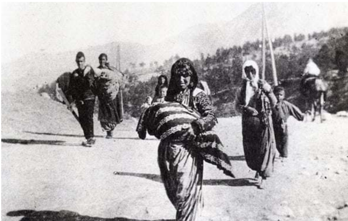
An Armenian woman forced to march in the desert carrying her child

As I said – a very, very strange tale, with overtones of "The Manchurian Candidate" and its post-hypnotic suggestions (remember the Queen of Diamonds?) triggering murderous, pre-programmed behavior.