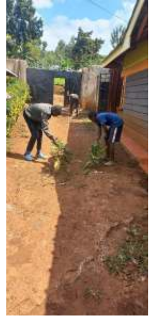
Sweeping the Compound