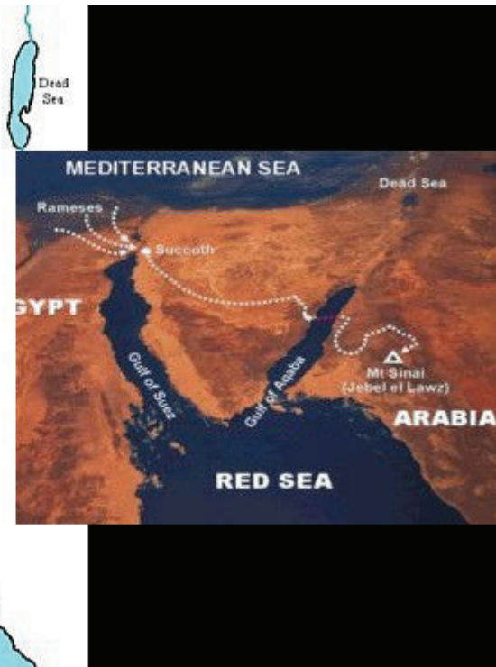
Map #2 -- Gulf of Aqaba Crossing