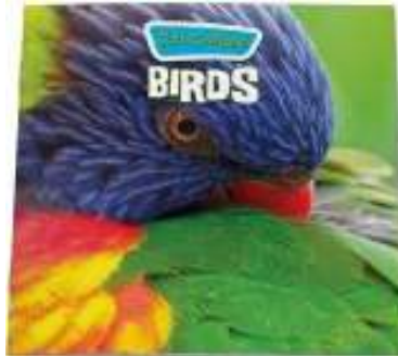
God Created Birds Book