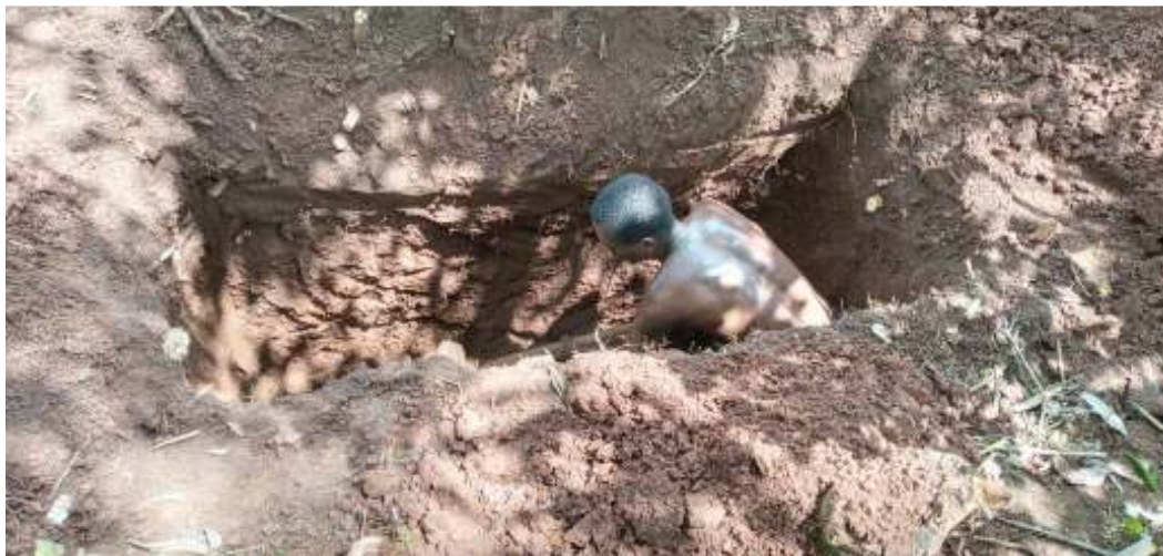
The digging is a two-man operation.

I don't thank you donors enough, but the funds you send continue to make a big impact in our brethren's lives. Life is tough there. Many in the surrounding villages are still dying from starvation, and still there are young boys (often times teenage boys) committing suicide by strangulation because they can't cope with the suffering. " Thy Kingdom Come " needs to be at the Top of the Prayer list.