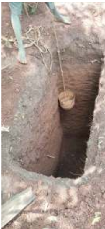
One man at the top pulling up the dirt. The other man at the bottom, digging and filling up the bucket.