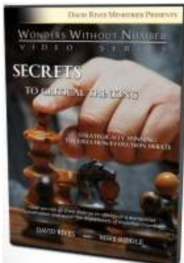
Secrets To Critical Thinking DVD