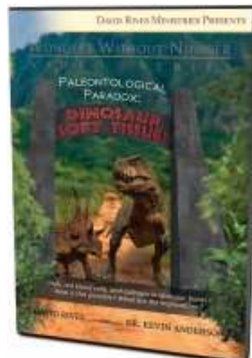
Paleontological Paradox: Dinosaur Soft Tissue DVD